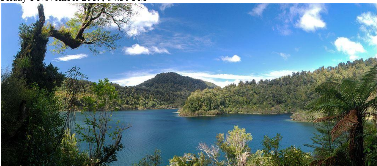
T\bar{u} hoe aims to open a fifth medical clinic on the shores of Lake Waikaremoana by late next year

Kawerau Medical Centre's model of care is the philosophical launch pad for central North Island iwi Tūhoe's ambitious expansion plans to improve the health of its people.