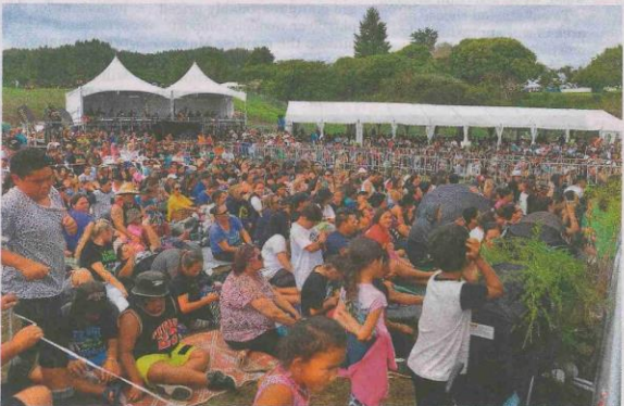
CROWDED HOUSE: The Te Ahurei a Tuhoe venue starts to fill up on Saturday. D3459-506