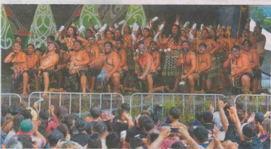
GROUP PERFORMANCE: Waimana haka end their performance full of pride. D3459-381