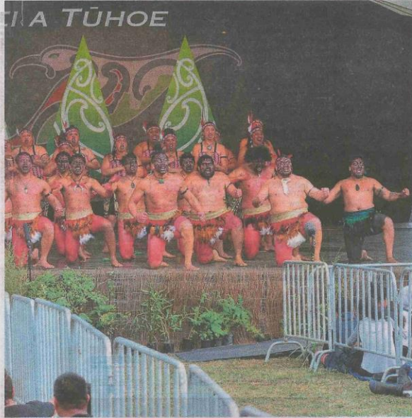
IN SYNC: Tuhoe ki Kawerau perform at Te Ahurei a Tuhoe festival on the weekend. D3459-149