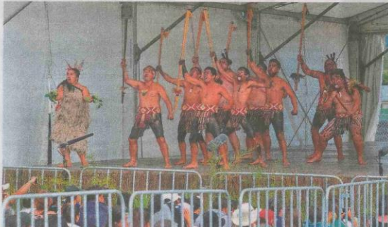
HIGH MOMENTS: Waimana haka team cut imposing figures as they raise their taiaha at Te Ahurei a Tuhoe on the weekend.